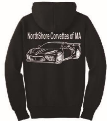
Black Full Zip Hood w/emb front and printed back $50