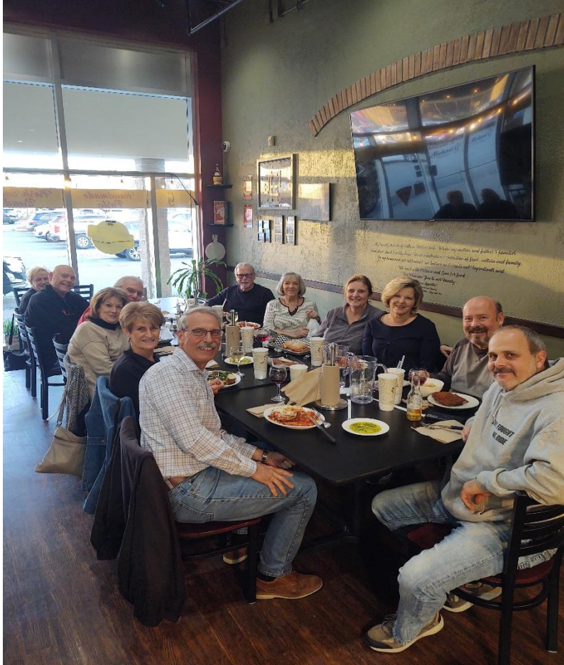
NSCM CREW AT MICHAEL G'S APRIL 19 TH , 2022