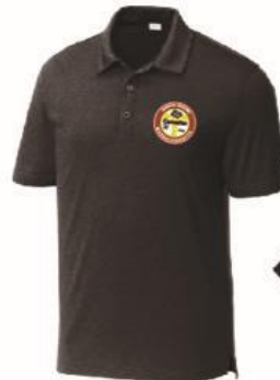
Embroidered Polos $30