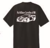
Tee Shirt embroidered front printed back $20