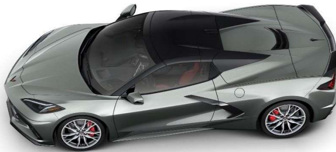
2024 Hypersonic Gray Corvette Convertible Price: $200 Tickets: 1500 Drawing: May 16, 2024 2:00 PM Central Time

To purchase any of these raffle tickets, you must go to the NCM website, download the raffle ticket form, and mail it. The museum will confirm your purchase.