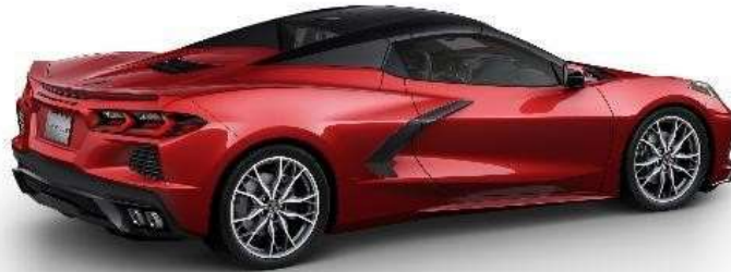
2024 Red Mist Corvette Convertible Price: $20.00 Unlimited Raffle Drawing: April 27, 2024 3:00 PM Central Time