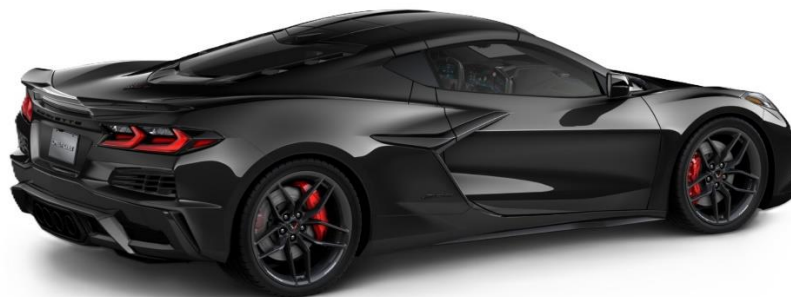
2026 Black Corvette Z06 Coupe