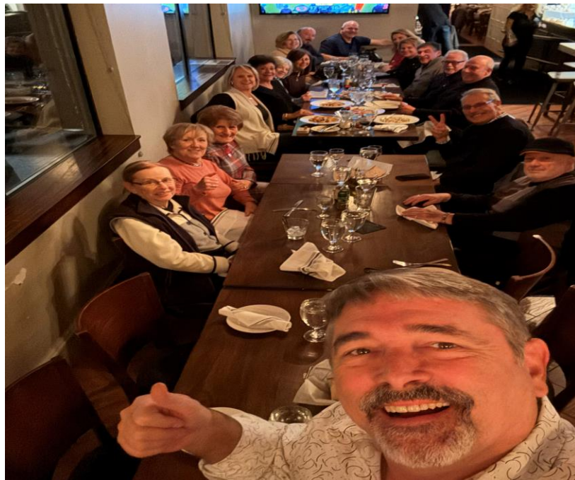
Monthly Dinner at K-Pub in Saugus for Fun and Trivia