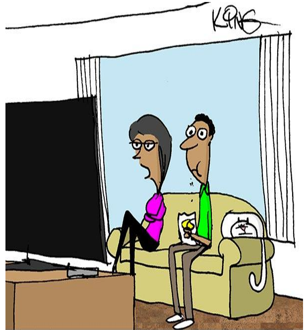
"Watching a video of you driving, washing and waxing your Corvette isn't what I had in mind for date night."