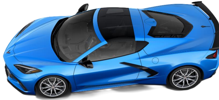
2026 Riptide Blue Corvette Coupe Price: $150 Tickets: 1500 Drawing: March 26 2:00 PM Central Time