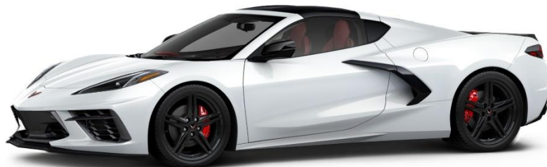
2026 Arctic White Corvette Coupe Price: $100.00 Tickets: 2000 Drawing: April 16, 2026 2:00 PM Central Time