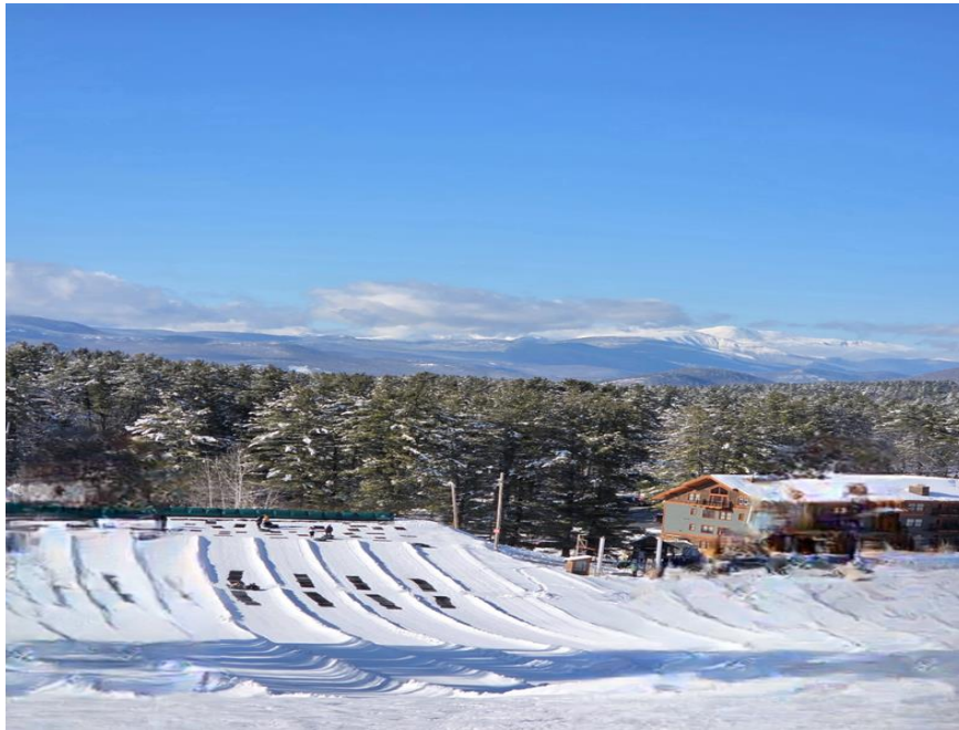
Sno Tubing on Mount Cranmore during the Chocolate Festival