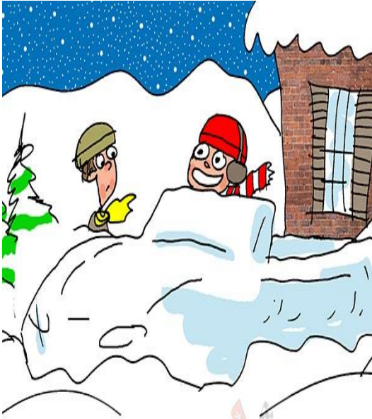
"Building a snow Corvette was funner than building a snow fort."