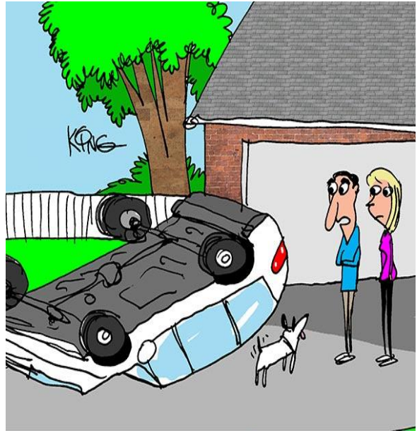
"Our car is just trying to get attention. It does this when I spend too much time with our Corvette."