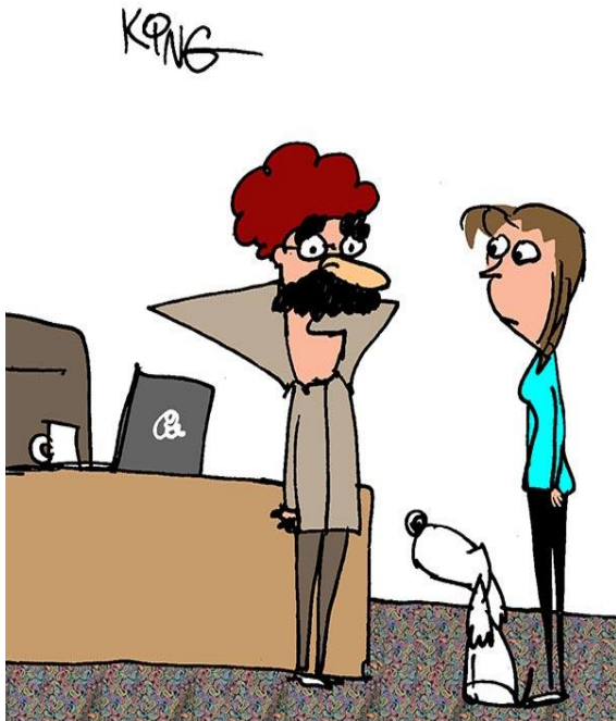
"I keep going to the dealership to look at their Corvettes. I'm wearing a disguise so they don't think I'm obsessed."